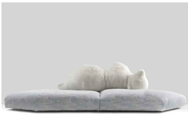
EDRA PACK SOFA