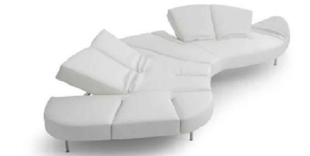
EDRA FLAP SOFA