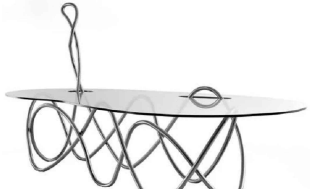
EDRA CAPRICCIO TABLE