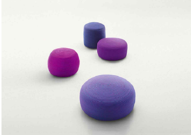
PAOLA LENTI OTTO POUF