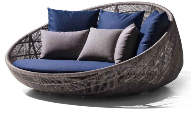
B&B ITALIA CANASTA 13