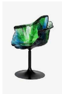
EDRA ELLA CHAIR